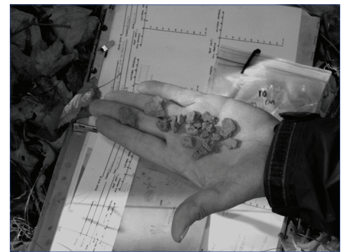
Both stone and ceramic artifacts were found on the island, with some test areas particularly fruitful. Archaeologist John Strot holds ceramic fragments before bagging them for further study.

which may include the intensive excavation of a small area.