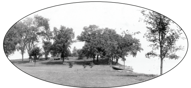
Commons, c. 1940