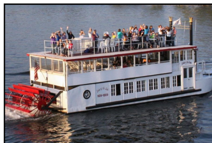
Lady of the Lake

Visit elmhs1.eventbrite.com for updates.