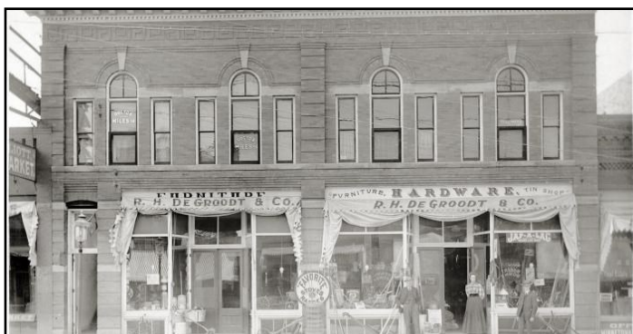
DeGroot Hardware Store at 234 Water Street, Excelsior, Minnesota, ca. 1905.

Little known stories connect Excelsior with historic events like the Minneapolis truck drivers' strike and riot, the origin of Roller Derby, and early steps towards equality for women. A cow, some very productive bees, a midnight snack, and one particular spot on a roller coaster all contributed to tragic outcomes. See how area families responded when faced with the unthinkable.